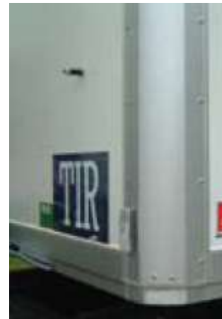
Truck Box Aluminum Frame

Optional decorative caps available to enhance corrosion and water resistance properties and complement joint material color.