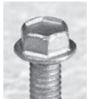
Hex Washer Head