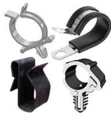
ROUTING - WIRE, TUBE & HOSE