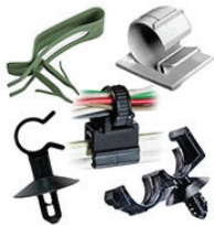
CABLE MOUNTS & CLIPS

EFC provides engineering support and innovative, engineered components for the wire harness and cable assembly industry.