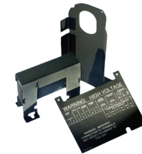
FLAME RETARDANT ELECTRICAL INSULATION