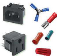
WIRE CONNECTORS AND DISCONNECTS