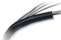
CONDUIT & TUBING