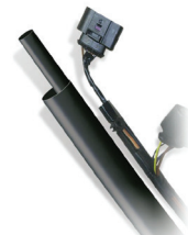
HEAT SHRINKABLE TUBING