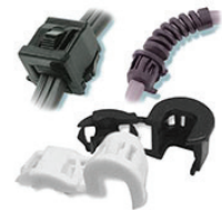
STRAIN RELIEFS FOR WIRES & CABLES