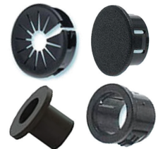
HOLE PLUGS, CAPS & BUSHINGS