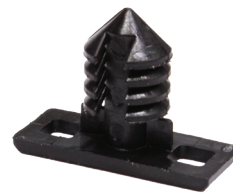
CHRISTMAS TREE CLIPS