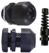
LIQUID TIGHT FITTINGS & CORDGRIPS